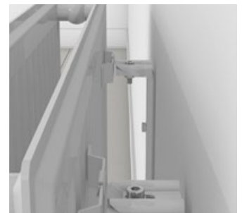
Available for different designs. For mounting on welding seam or for mounting on lugs.