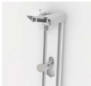
Easy installation and height adjustable for the correct placement.